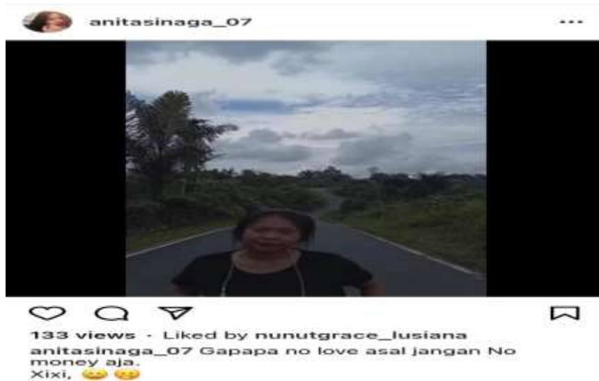
Picture1. "Gapapa no love asal jangan no money aja.xixi,".

The example is Casual style because it's used non-formal. The status shows that the teenagers as Instagram users use the casual style because of not bound grammatical rules and the vocabulary used is incomplete (unofficial pronouns) such as Tidak apa-apa change to Gapapa and Saja change to Aja . It shows that he wears a casual style that is aimed at the closest people such as family or friends. So the researchers want to find out and analyze the frozen style, casual style, intimate style, consultative style, and formal style on making caption of teenagers as Instagram users. The purpose of this researchers is to determine the language styles of teenagers as Instagram users on post captions. The researchers found that some are the previous study that focuses on language style." Dinda Dwi Maharani (2019) from Muhamadiyah University of Mataram's faculty of teacher training and education conducted a sociolinguistics analysis of the movie's language style. She's in the middle of an analysis of a movie line when she hears it.